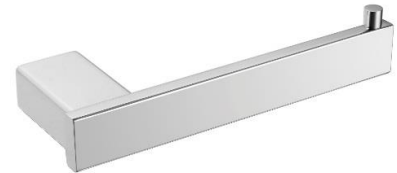
AI1421CS Satin finish