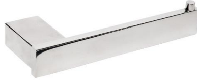
AI1421C Bright finish