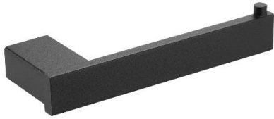
AI1421B Black finish